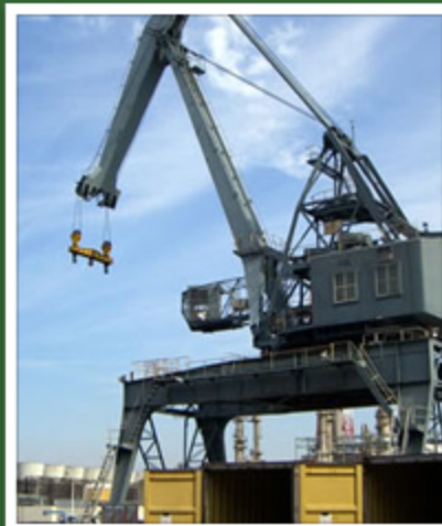
Import Customs clearance